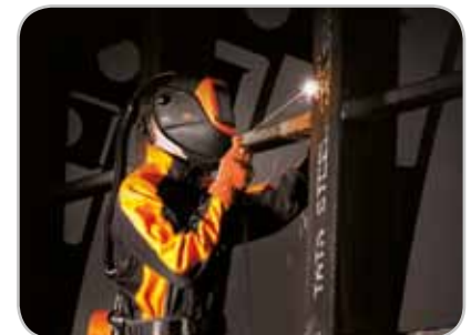
Construction and site welding in demanding conditions

Read more from our website: www.kemppi.com/wps