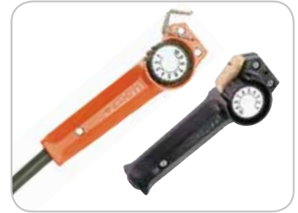
R10 and R11-T

The two remote control options add convenience and cost-efficiency to your welding operations. Using R10 enables welding parameters to be set conveniently at welding site. The wireless R11-T adds even more freedom and easier mobility.