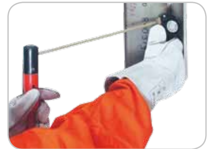
R11-T wireless remote controller can be used simply by touching the electrode