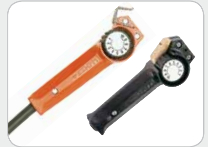
R10 and R11-T

The two remote control options add convenience and cost-efficiency to your welding operations. Using R10 enables welding parameters to be set conveniently at welding site. The wireless R11-T adds even more freedom and easier mobility.