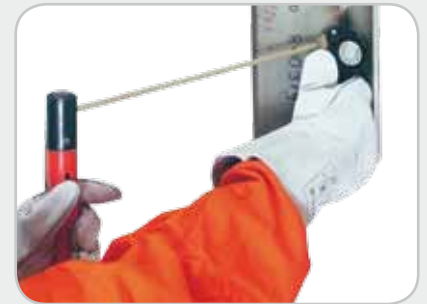
R11-T wireless remote control units can be used simply by touching the electrode